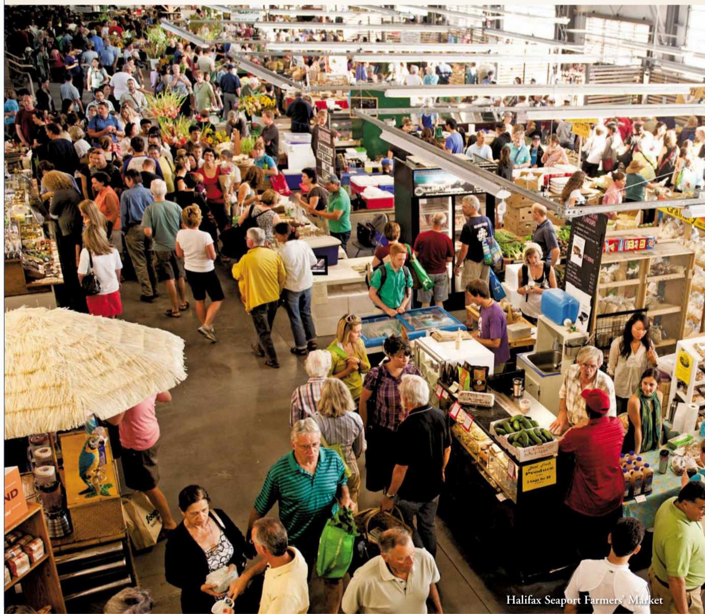
Halifax Seaport Farmers' Market